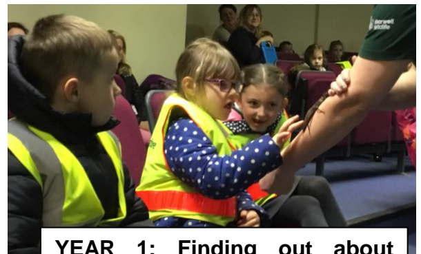
YEAR 1: Finding out about animals & feeling & looking at LARGE stick insects