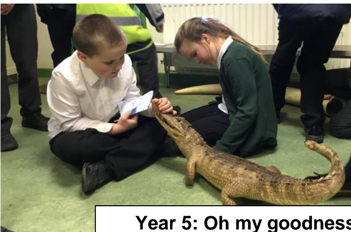
Year 5: Oh my goodness – a crocodile! How very brave!! (Don't panic ask the children how they got to touch a crocodile?)