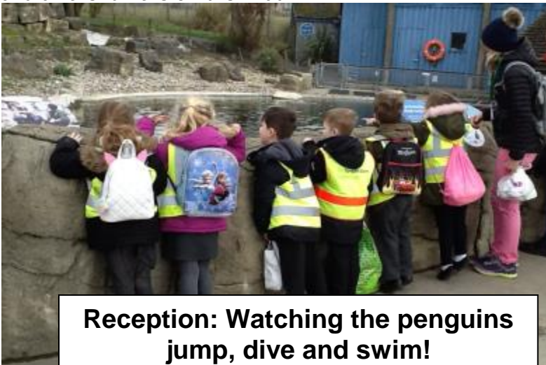
Reception: Watching the penguins jump, dive and swim! 8/3/2019

During the day, we captured some wonderful moments and asked the children about the educational visit and there are lots of photos on the class blogs. Please do take a look, to see the learning gained and all the fun the children had.