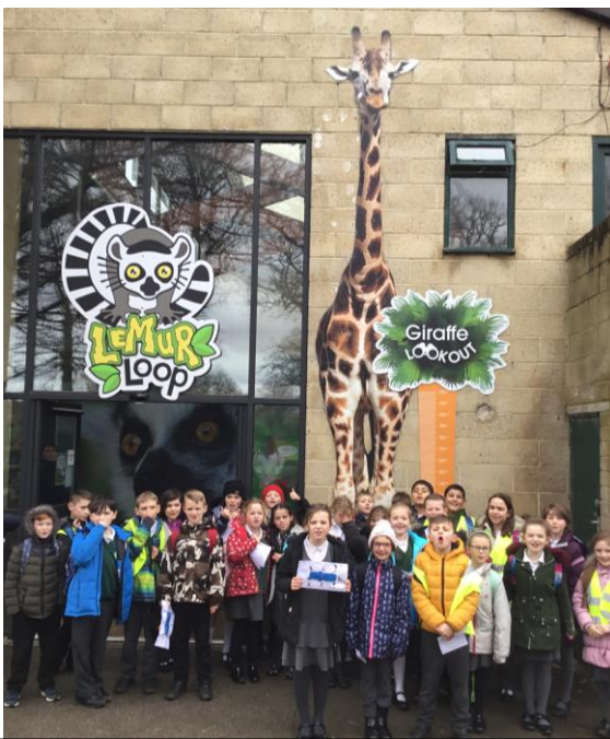
Year 4: Measuring up to a giraffe!