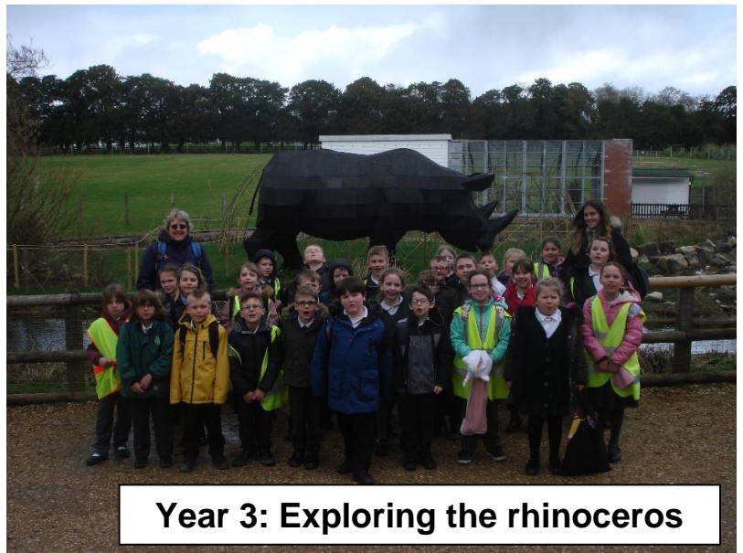
Year 3: Exploring the rhinoceros